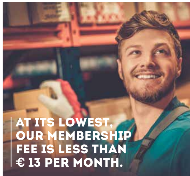
Examples of work income, membership fees and unemployment allowances as of January 1, 2018

The table below shows examples of work income, membership fees and unemployment allowance levels. If your annual YEL work income is e.g. € 21,850, you can base your insurance with SYT on any amount between € 12,816 and € 21,850.